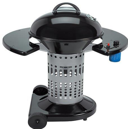
BONESCO QUICKSTART S