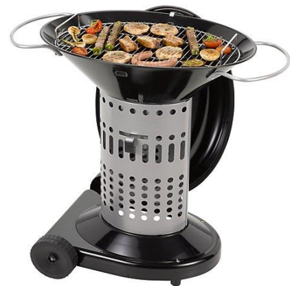
BONESCO CHARCOAL L