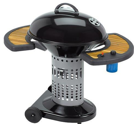
BONESCO QUICKSTART L