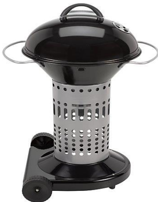
BONESCO CHARCOAL S