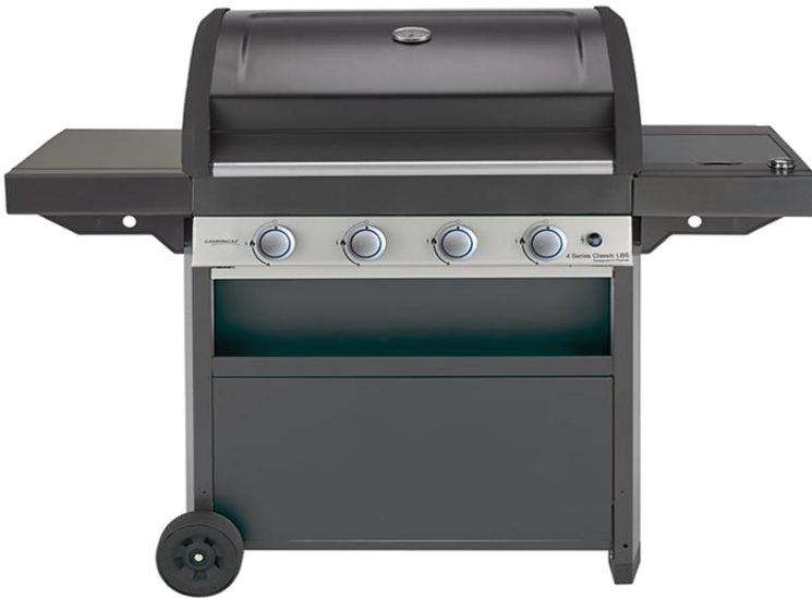
4 SERIES CLASSIC LBS