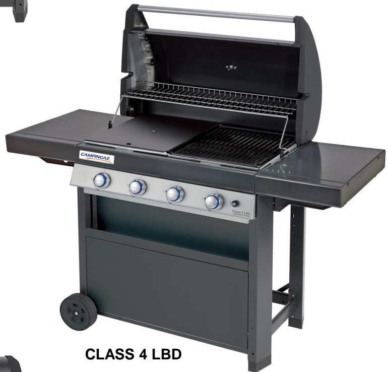
CLASS 4 LBD