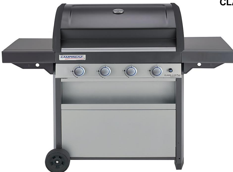
CLASS 4 LB PLUS