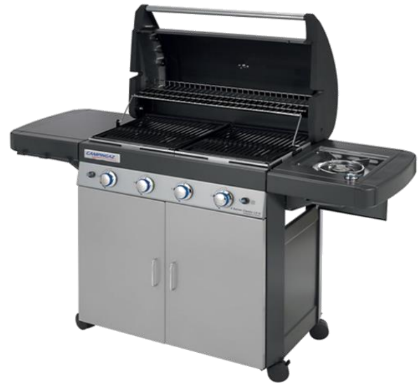
4 SERIES CLASSIC LS G