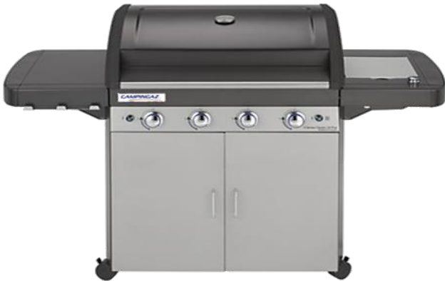
4 SERIES CLASSIC LS 4 SERIES CLASSIC LS PLUS