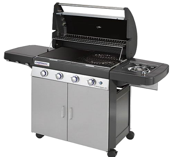
4 SERIES CLASSIC LXS