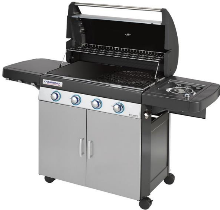
4 SERIES CLASSIC EXS