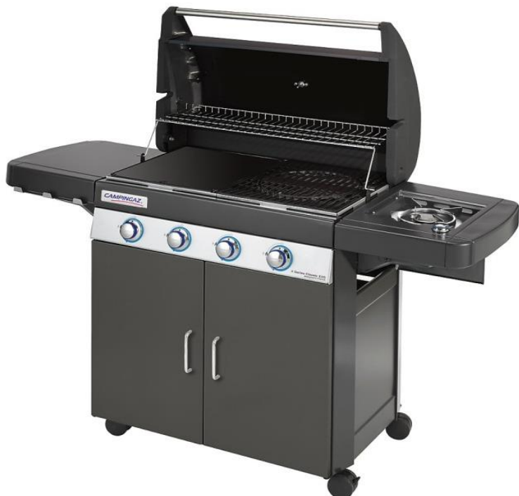
4 SERIES CLASSIC EXS / EXS D