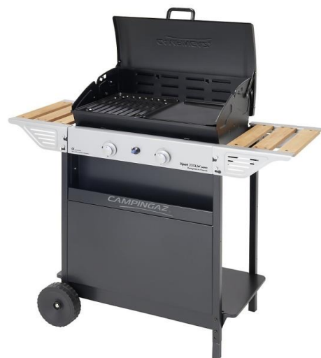
200 LW VARIO 200 LW PLUS VARIO