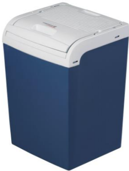
SMART 20 L