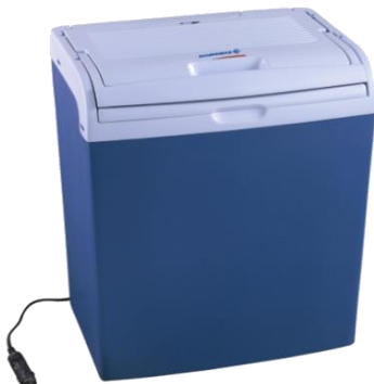
SMART 25 L