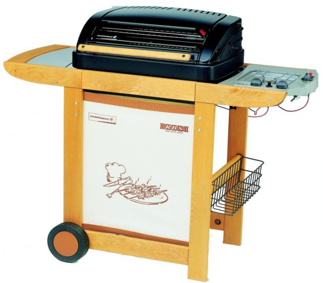
RBS WOODY DELUXE