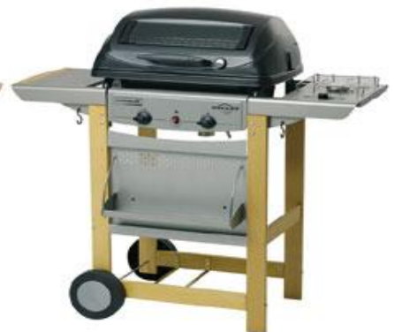
WOODY ADVANTAGE DELUXE