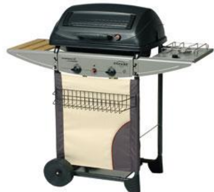
DELUXE & LUXE