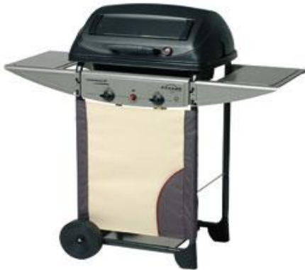
2 PLUS & SUPER