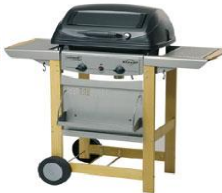
WOODY ADVANTAGE & VENTURA WOODY