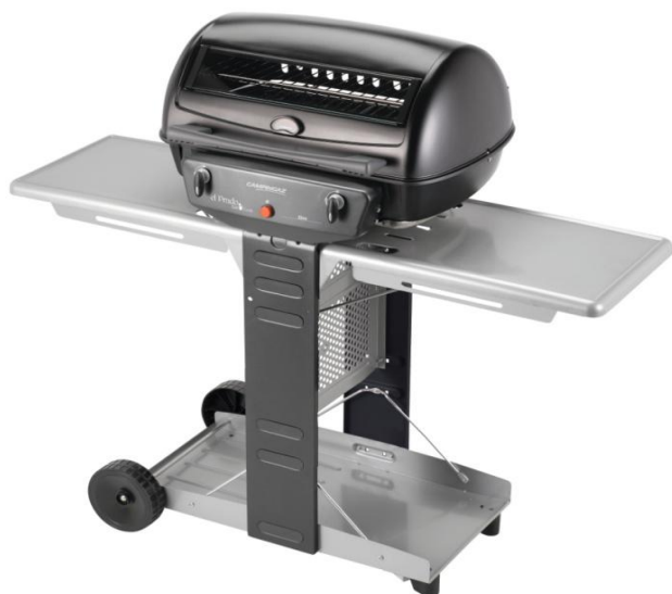
EL PRADO 2200