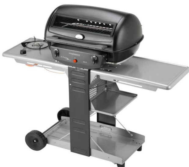
EL PRADO 2200 D