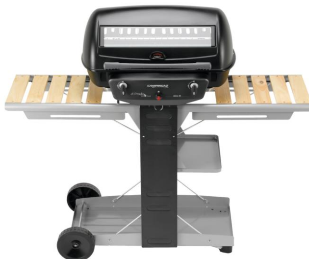
EL PRADO 2200 W