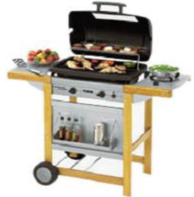
TEXAS WOODY DELUXE & VENTURA WOODY GRANDE DELUXE