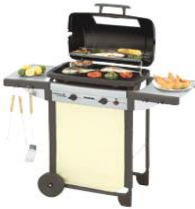
TEXAS & TEXAS SUPER