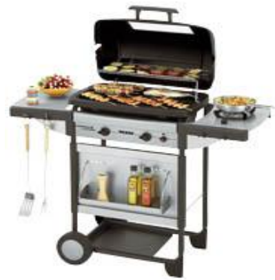
TEXAS DELUXE EXTRA