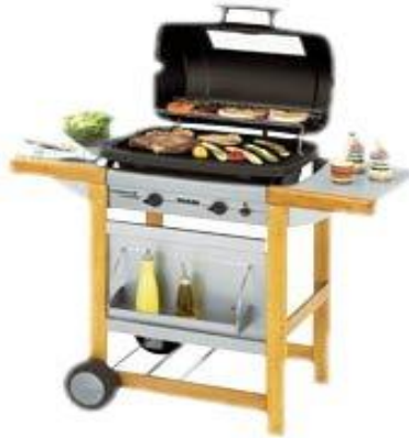
TEXAS WOODY & VENTURA WOODY GRANDE