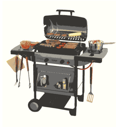
TEXAS US DELUXE