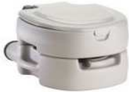
FLUSH TOILET - S