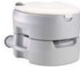
FLUSH TOILET - L