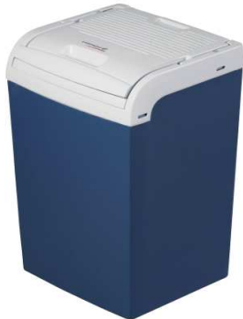
SMART 20 L