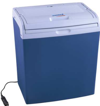
SMART 25 L