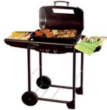
PRIMERO CLASSIC DUO

Jets / Injecteurs : 28 mb : 63558 - 75802 50 mb : 66340