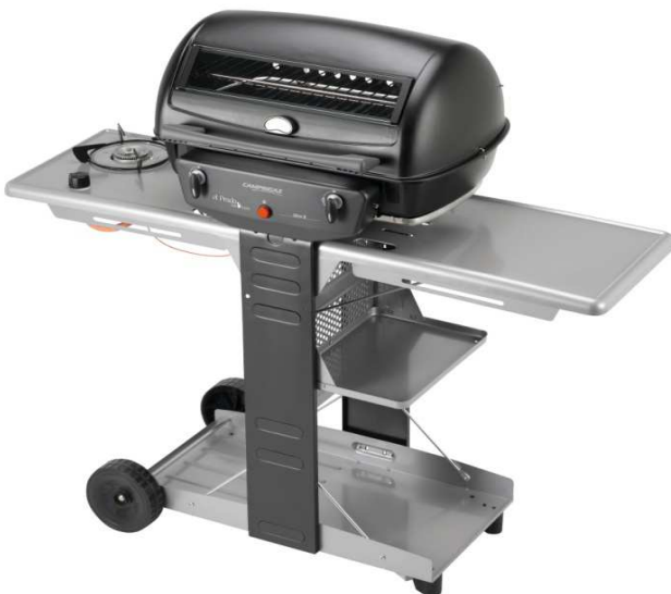
EL PRADO 2200 D