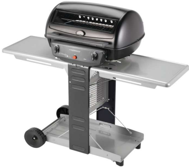
EL PRADO 2200