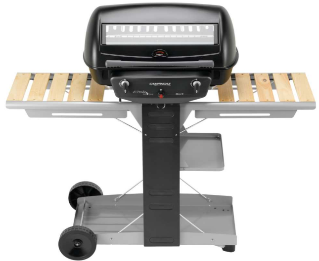
EL PRADO 2200 W