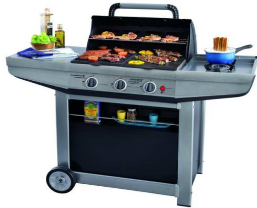
ADELAÏDE 3 PREMIUM DELUXE