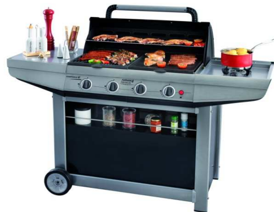
ADELAÏDE 4 PREMIUM DELUXE