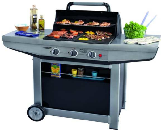
ADELAÏDE 3 PREMIUM