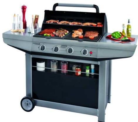
ADELAÏDE 4 PREMIUM